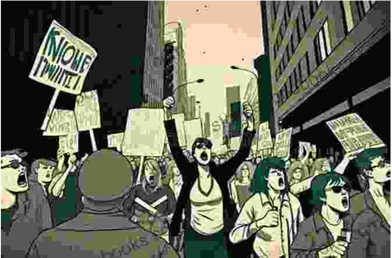
Image Description: A group of labor union members holding signs and chanting, representing the foundation of a democratic society.

Labor, the collective power of workers, has played an equally important role in shaping America. By organizing and demanding better wages, working conditions, and benefits, labor unions have fought for the rights of workers and contributed to the creation of a more just and equitable society.