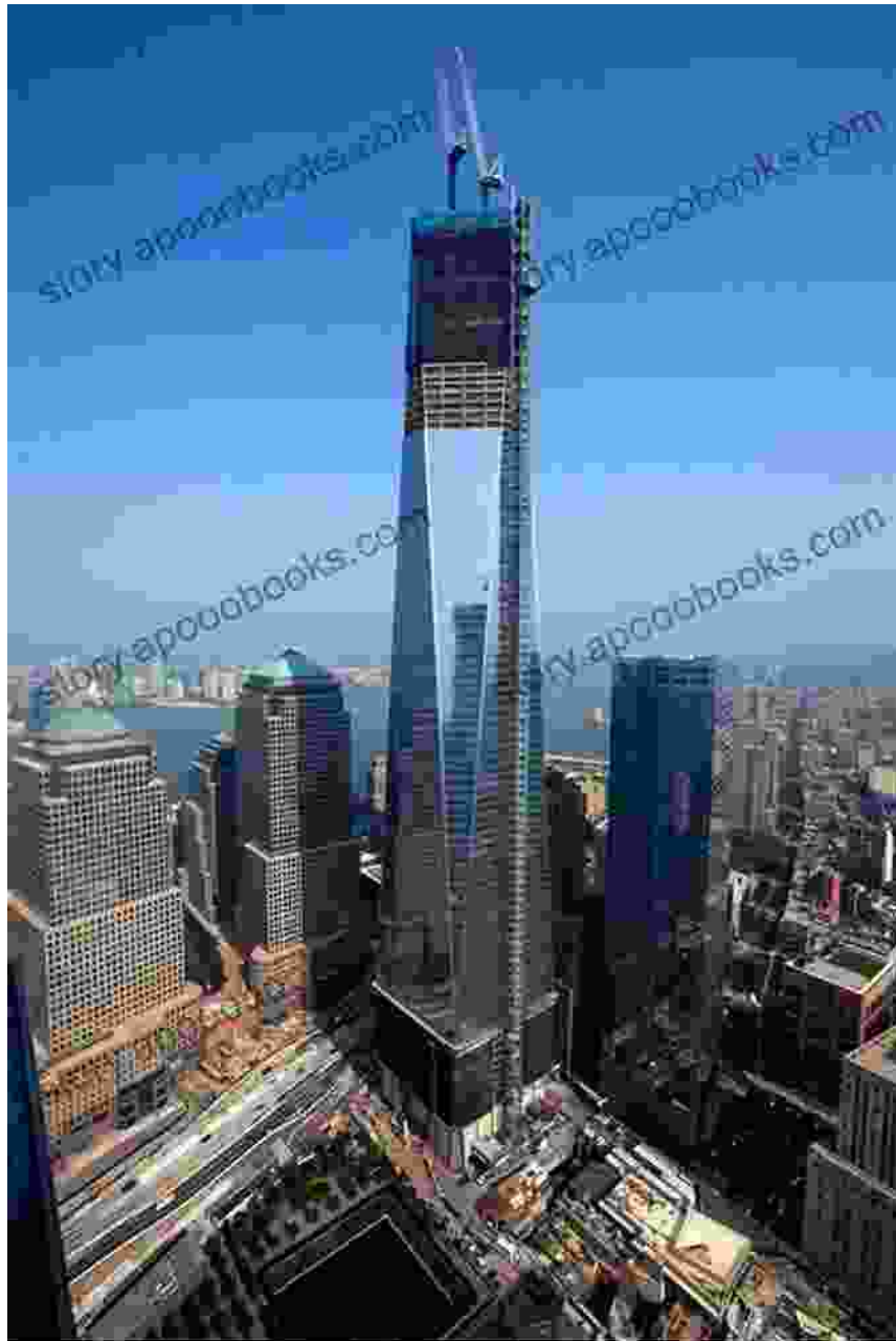
Unveiling the Historical Tapestry

Marvel at the architectural masterpieces that have reshaped the New York skyline. From the soaring heights of One World Trade Center to the graceful curves of the Oculus, each building in the Financial District is a testament to human ingenuity and artistic vision. Our tour will take you on a journey through time, showcasing the evolution of architectural styles and the stories behind the iconic structures that define this neighborhood.