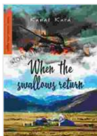
Image Alt Attribute: A beautiful cover of the book "When The Swallows Return" featuring a young woman looking out at the sky.

Free Download your copy of "When The Swallows Return" today and embark on a literary journey that will stay with you forever.